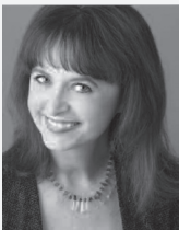
Certified Medium Ordained Minister

WinterBrookMedium.com • winterbrookpsychicmedium@gmail.com